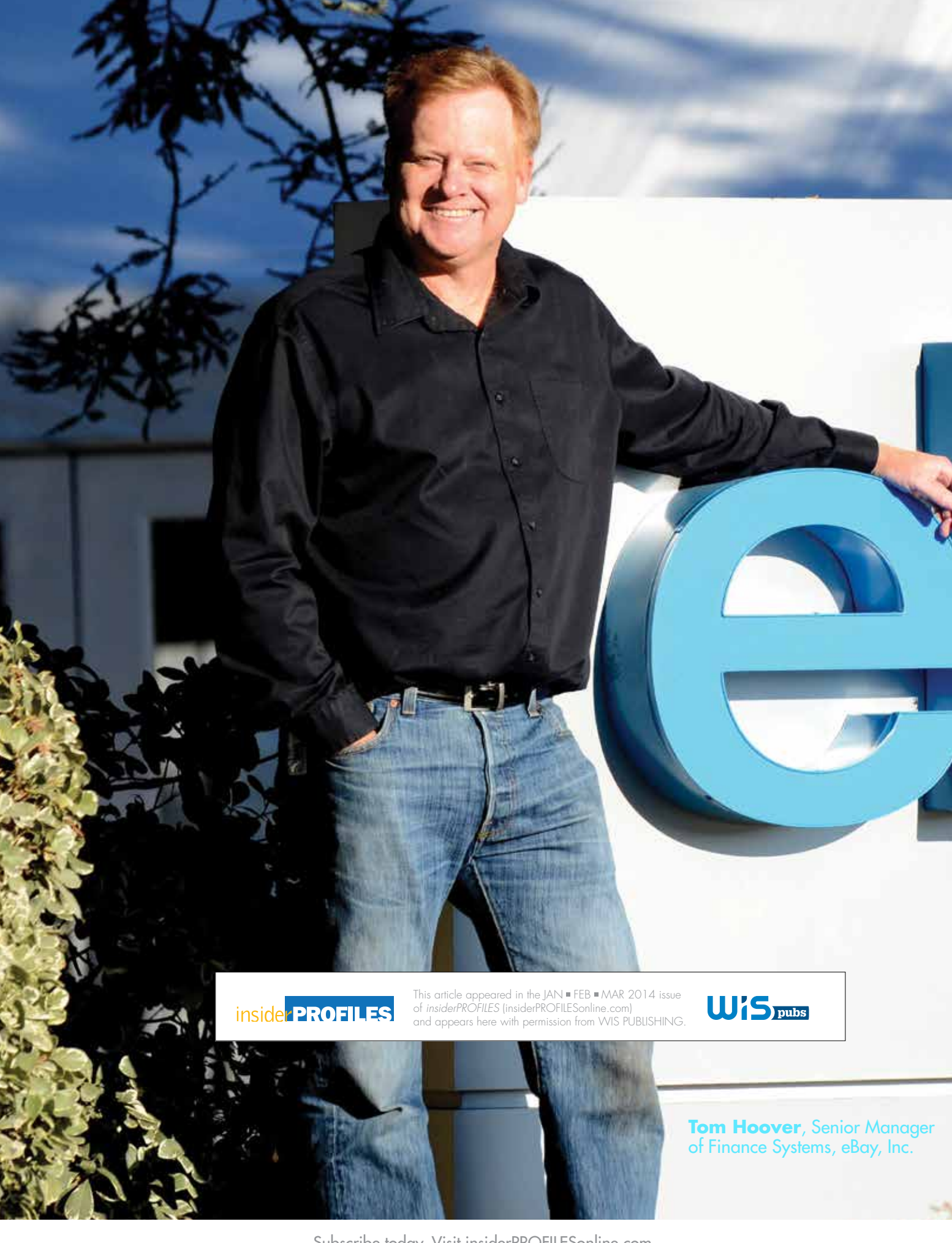
Subscribe today. Visit insiderPROFILESonline.com